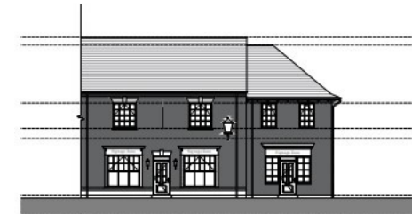
LHB4 - Proposed Front Elevation